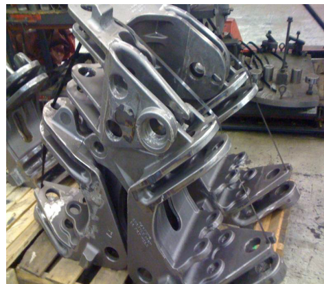
Corrosion Protection with V-9837 Water Base Rust Inhibitor